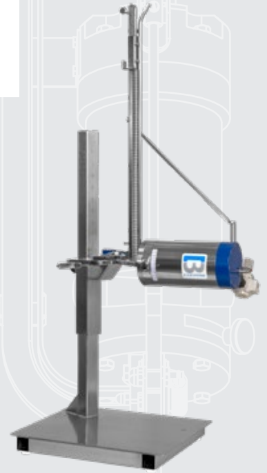
ALSO AVAILABLE IN HORIZONTAL VERSIONS